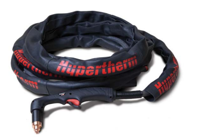
Leather torch sheathing

Available in 7,6 m sections, this option provides additional protection for torch leads against burn-through and abrasion.