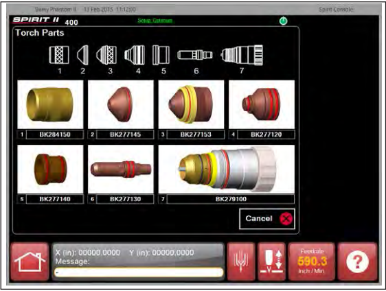
Integrated Spirit II Console