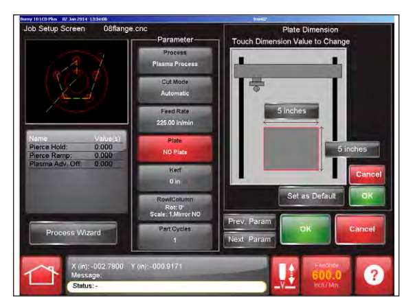
Job Set Up