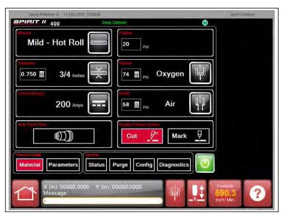
Integrated Spirit II Console