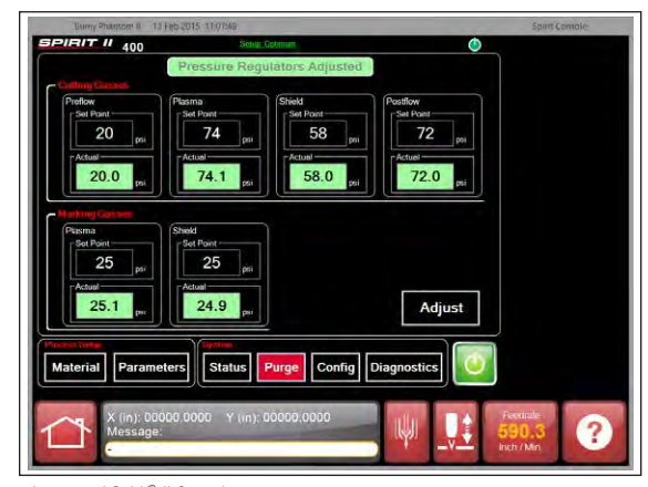
Integrated Spirit® II Console